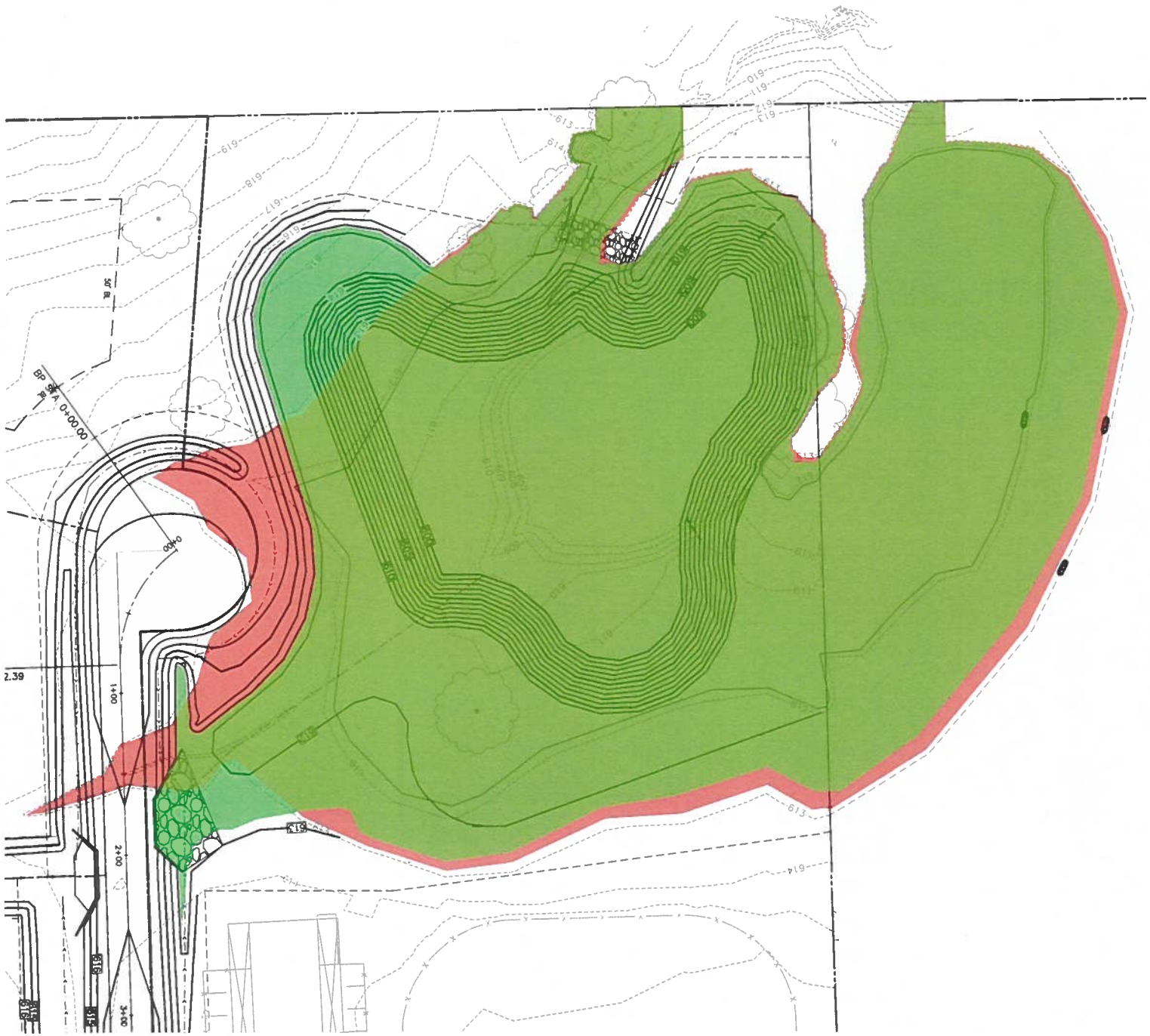
100 YEAR SURFACE ELEVATION PRE VS POST